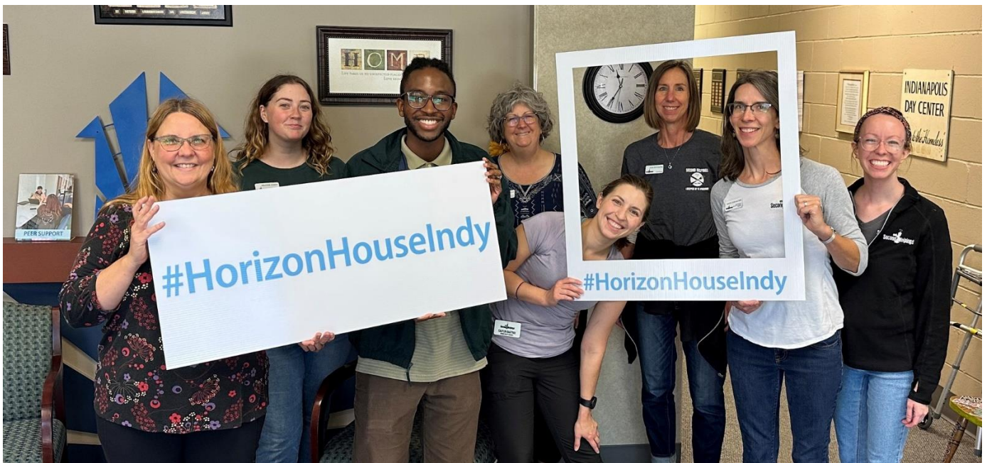
The ABIDE Community Engagement subcommittee coordinated a fun morning of volunteering with our partner across the street, Horizon House, in August 2023